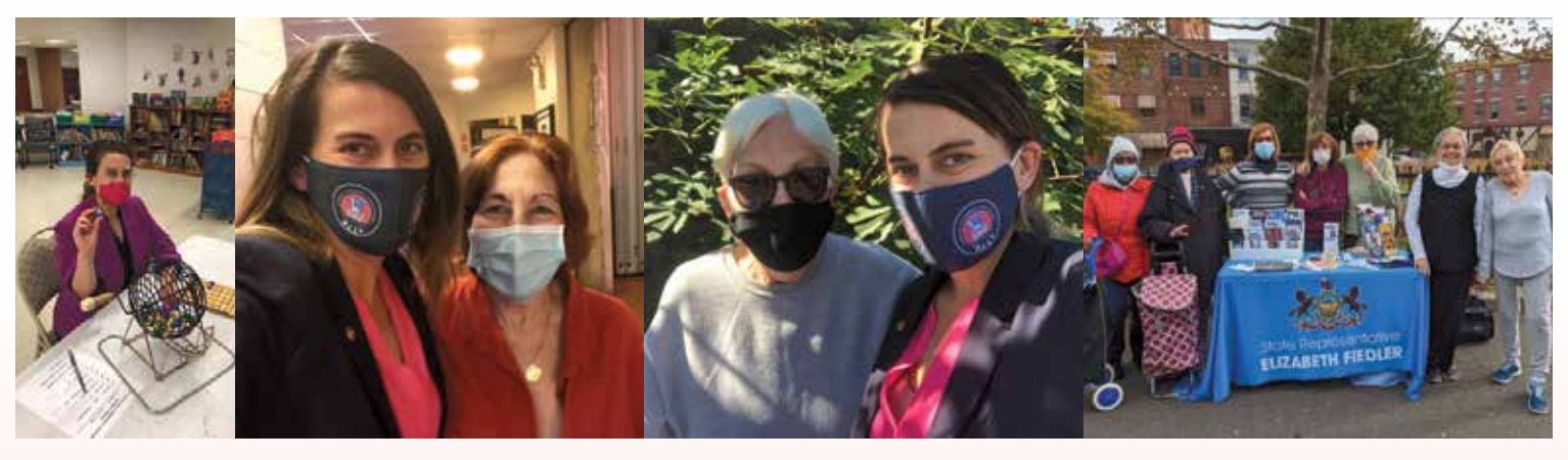
It's my honor to serve senior citizens across our district with Property Tax/Rent Rebates, vaccination appointments, and car registrations! I had a great time talking with seniors and calling bingo at the East Passyunk Community Center. And my staff and I had a wonderful time catching up at the South Philadelphia Older Adult Center.