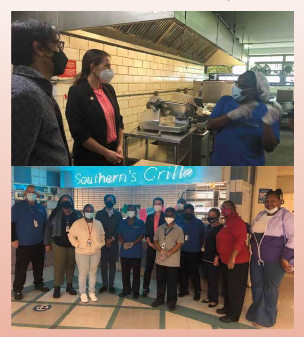
Strong schools are vital to our families, our children and to our city's future. I had the chance to thank food service workers, climate staff, teachers, school nurses and additional staff, while visiting South Philly High.